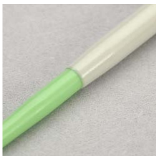
PreludeEASE™ Hydrophilic Sheath Introducers

For smooth and easy insertion leading to patient comfort.