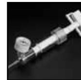
ENDOTEK BIG60™ Inflation Device