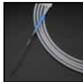
MAXXWIRE® Guide Wire