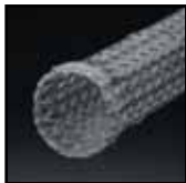
Fully Covered ALIMAXX-ES™ Esophageal Stent